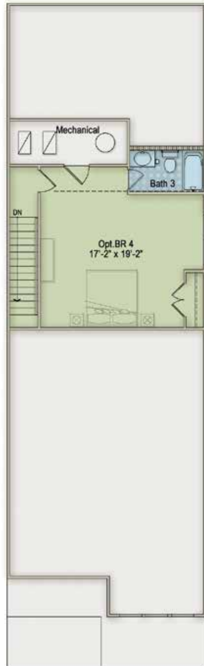
OPTIONAL BEDROOM 4 W/FULL BATH SECOND FLOOR