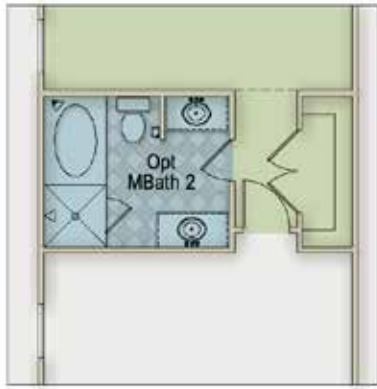
OPTIONAL SECOND FLOOR

LAYOUT AND SQUARE FOOTAGE VARIES SLIGHTLY ACCORDING TO EXTERIOR DESIGN. FLOOR PLAN SHOWN IS THE SOUTHERN PLANTATION EXTERIOR DESIGN.