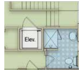
OPTIONAL ELEVATOR/ BATHROOM