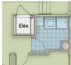
OPTIONAL ELEVATOR/ LAUNDRY

LAYOUT AND SQUARE FOOTAGE VARIES SLIGHTLY ACCORDING TO EXTERIOR DESIGN. FLOOR PLAN SHOWN IS THE CRAFTSMAN EXTERIOR DESIGN.